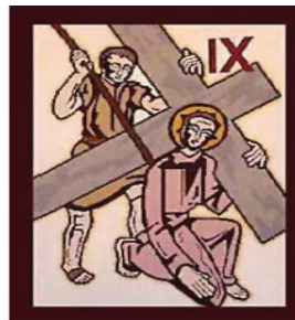
Jesus falls a third time.

Stations of the Cross: 6:30 PM Mass: 7:00 PM